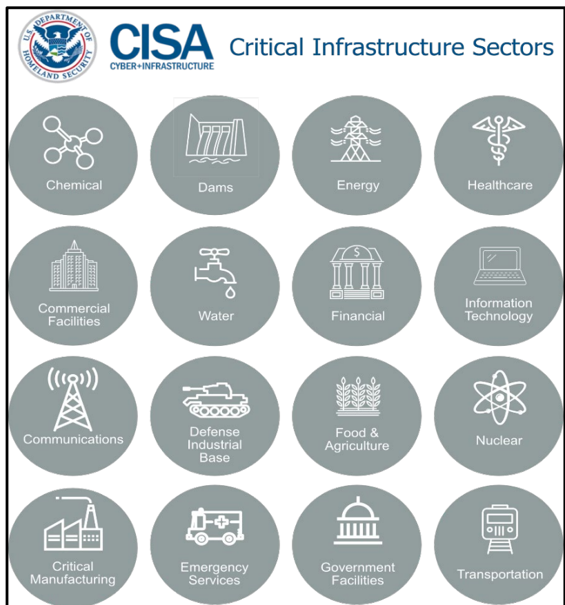
Figure 1. Department of Homeland Security list of the 16 U.S. Critical Infrastructure Sectors .

Our key to success lies in developing systems that can not only defend against attacks but also minimize effects on delivery of critical services, regardless of the cause of failure. Since all of the Nation’s critical infrastructure (Figure 1) is composed of cyber-physical systems, we have taken a broad approach that can benefit every sector.