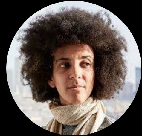
Timnit Gebru (1983-Present)