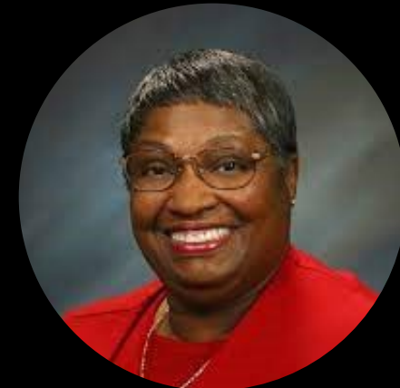
Alexa Canady (1950-Present)

Past and Present Diverse Groundbreaking Scientific Research Innovators