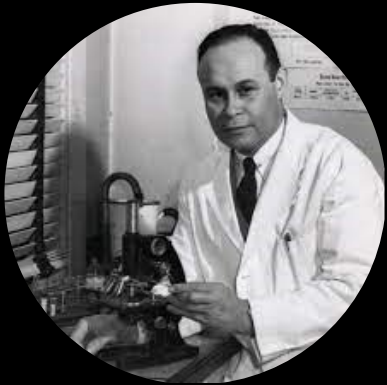
Charles R. Drew (1904-1950)