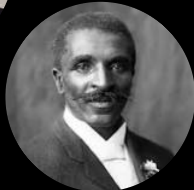
George Washington Carver (1864-1943)